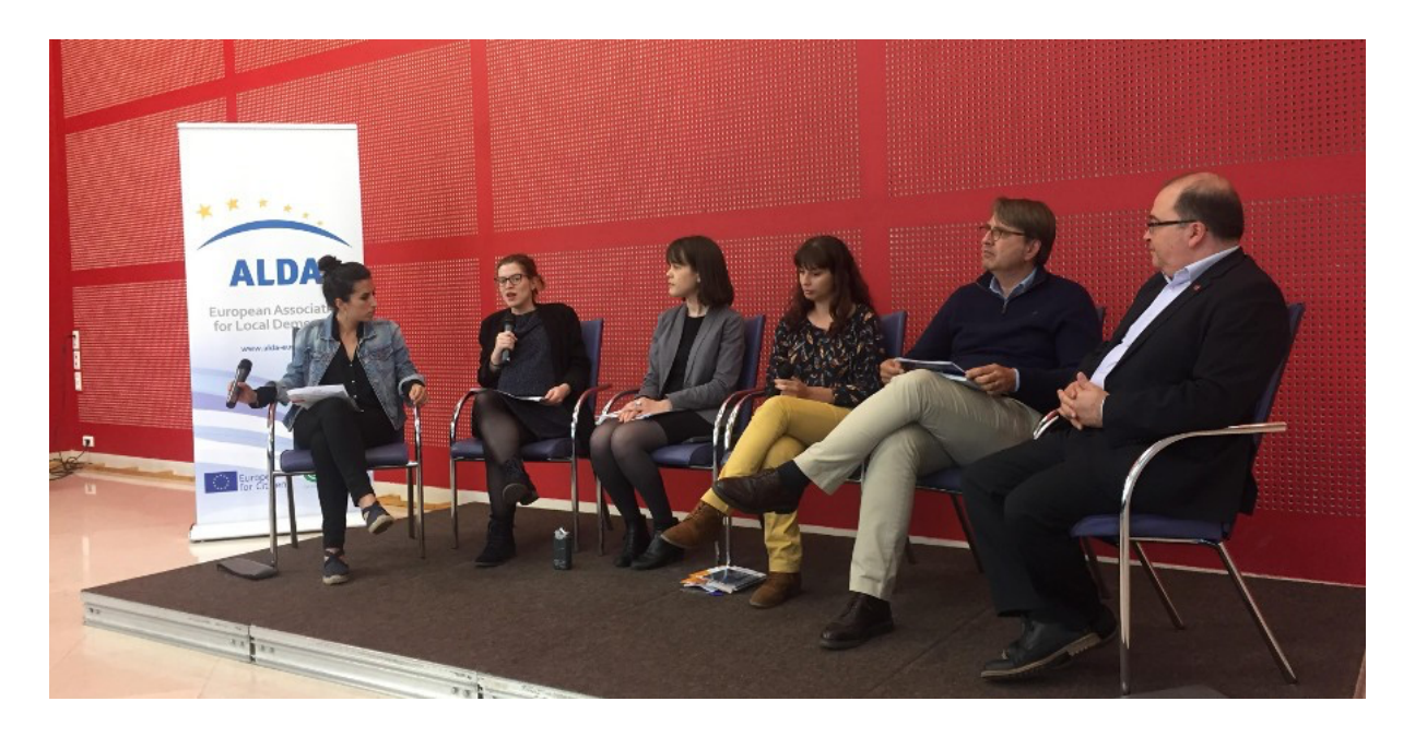
On 14 June, ALDA officially launched the Student Talent Bank project, dedicated to