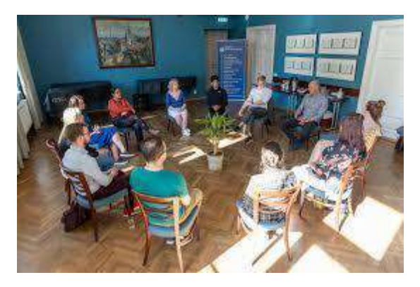
Activities implemented during the programme