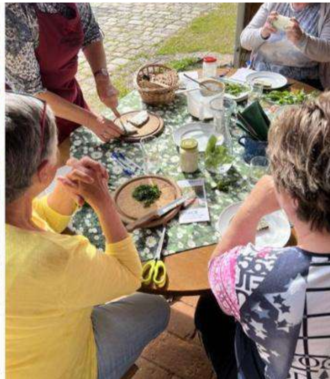
Extracts from the videos of creating self-made herbs and physical activities for elderly people (filmed at VHS Cham, 2023)